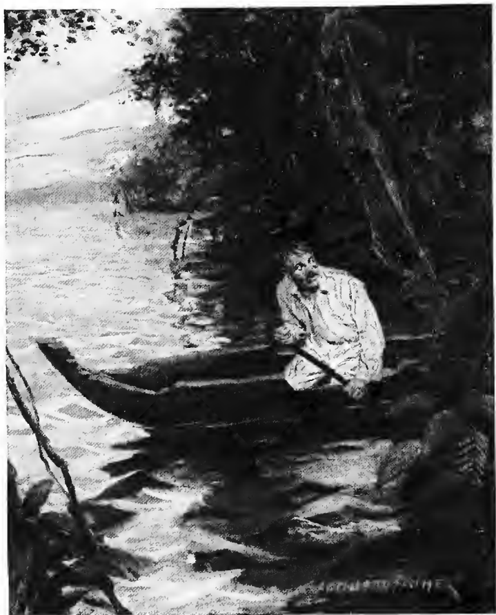
“It was a leaky and abandoned dugout, and he paddled slowly”